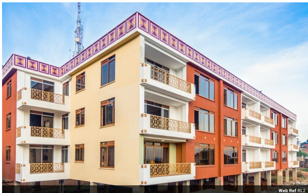
Web Ref RL2

5th Floor Rwenzori Towers Wing A Kampala