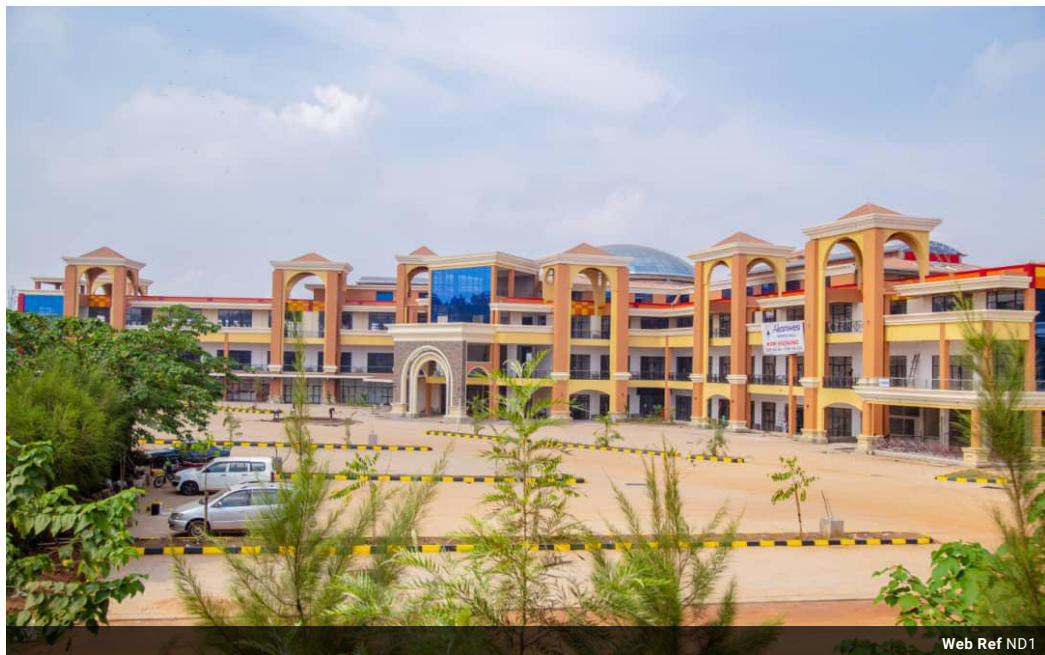
Web Ref ND1

5th Floor Rwenzori Towers Wing A Kampala